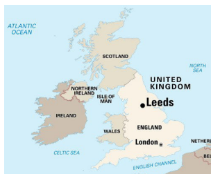
Where are we in the UK?