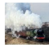
Sir Nigel Gresley