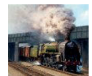
RA Riddles 1960