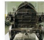
George Stephenson 1829