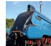
Sir Nigel Gresley 1938